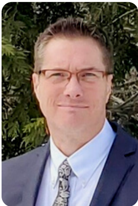
Robb Noon Mayor

- Council of the Municipality of Callander