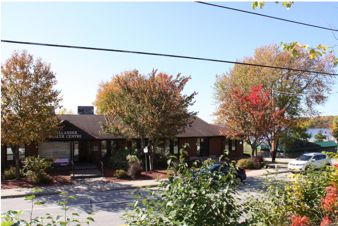
Callander Medical Centre